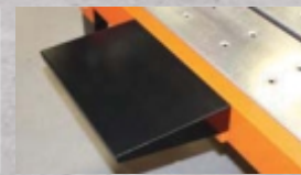
SIDE EXTENSION TABLE