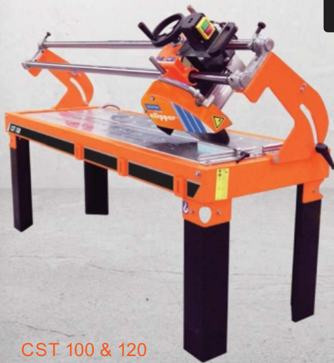
CST 100 & 120