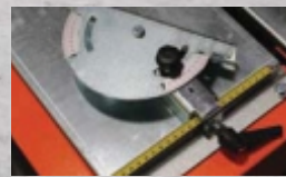
ADJUSTABLE GUIDE ANGLE